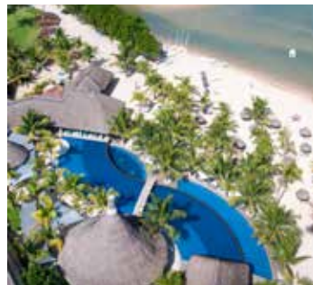
HERITAGE C BEACH CLUB