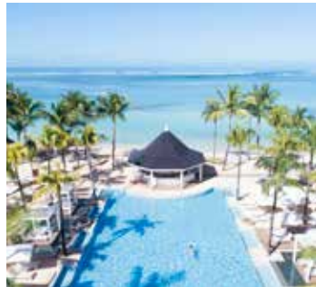
HERITAGE LE TELFAIR

CELEBRATE The Great Outdoors 1300 HECTARES NATURE RESERVE