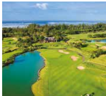
HERITAGE GOLF CLUB