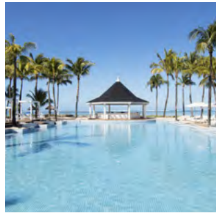
Heritage Le Telfair