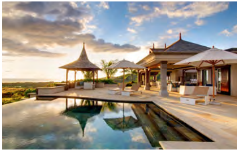
Heritage The Villas